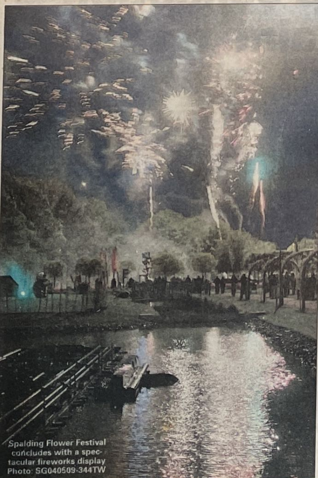
Spalding Flower Festival concludes with a spectacular fireworks display