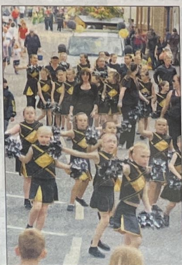
Young cheerleaders from Diamondz DG show off their routine.