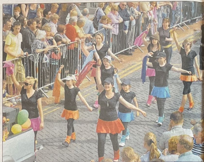
The Dreamz Dance group made waves in their second year in the parade.