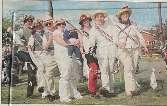
Morris dancers from Moulton Chapel Methodist Church were among those entertaining at the village's 30th parade.