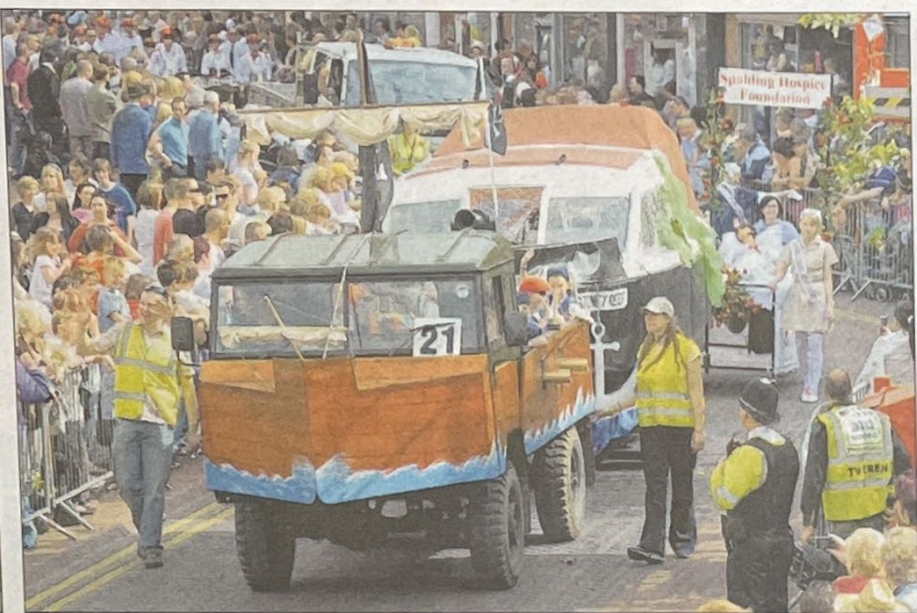
Spalding Water Taxi makes a splash in the parade.