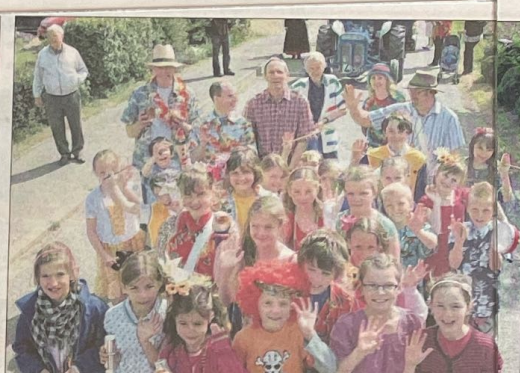
Children from Moulton Chapel Primary School had a float in the annual parade.