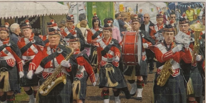
The Breaston Highlanders Band make its way around Springfields.