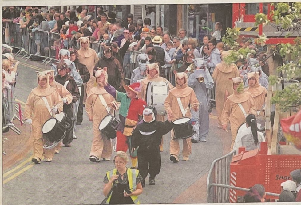
Romsey Old Cadets play cat and mouse as they start the parade