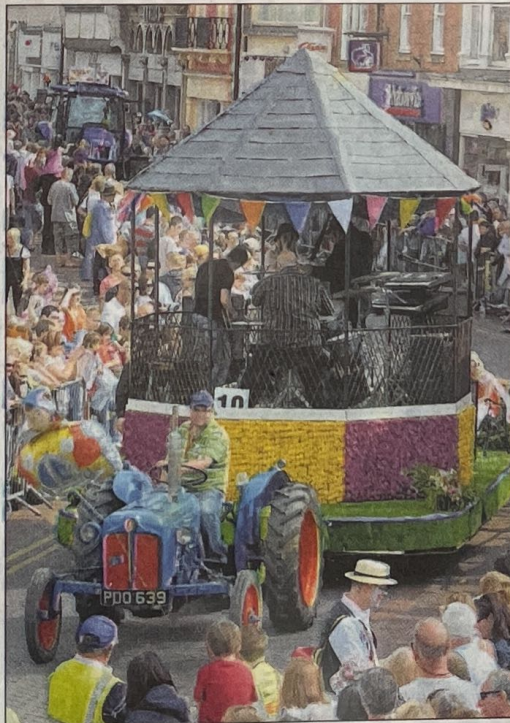
Moulton Chapel's float called Strike up the Band added a touch of brass to proceedings.