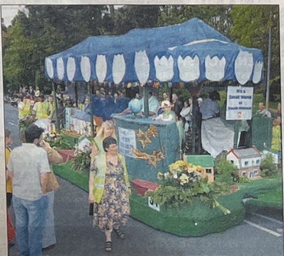
It's a Small World was the first parade entry for friends of Queen Elizabeth Doll Houses.