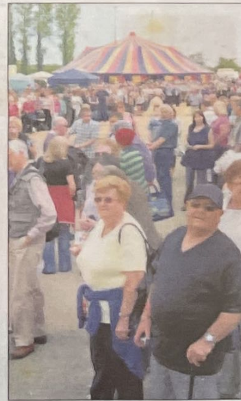
Crowds enjoy the entertainment at Springfields.