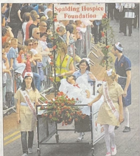
Onlookers had to be patient for entry number 22 – the Spalding Hospice Foundation bed push.