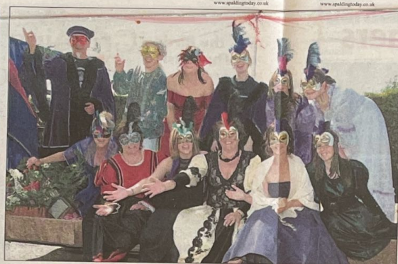
Their stylish outfits won the Masqueraders the title of best float.