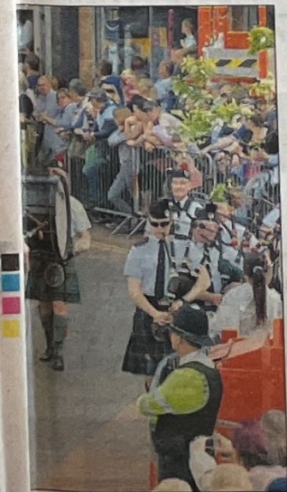
through Spalding.