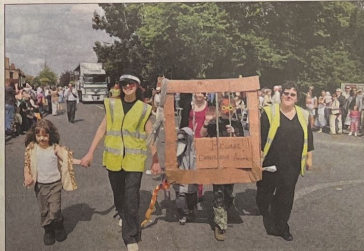
Surflet Scamps had to deal with a little monster as they passed through the streets of Spalding.