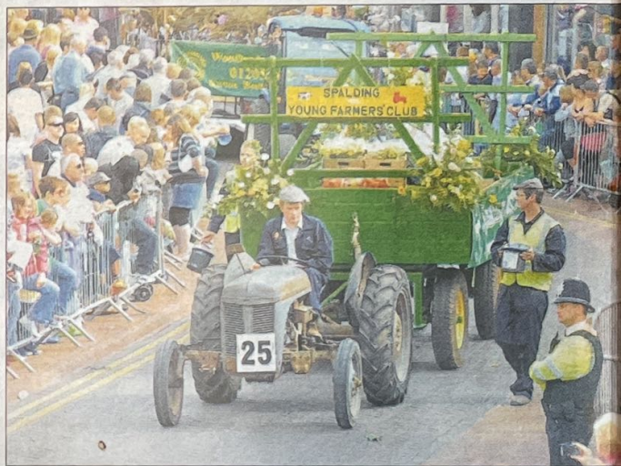
Spalding Young Farmers' Club has had an annual entry in the parade since the event started.