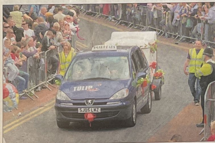
The Tulip Radio car, complete with little prince and princesses, takes to the road.