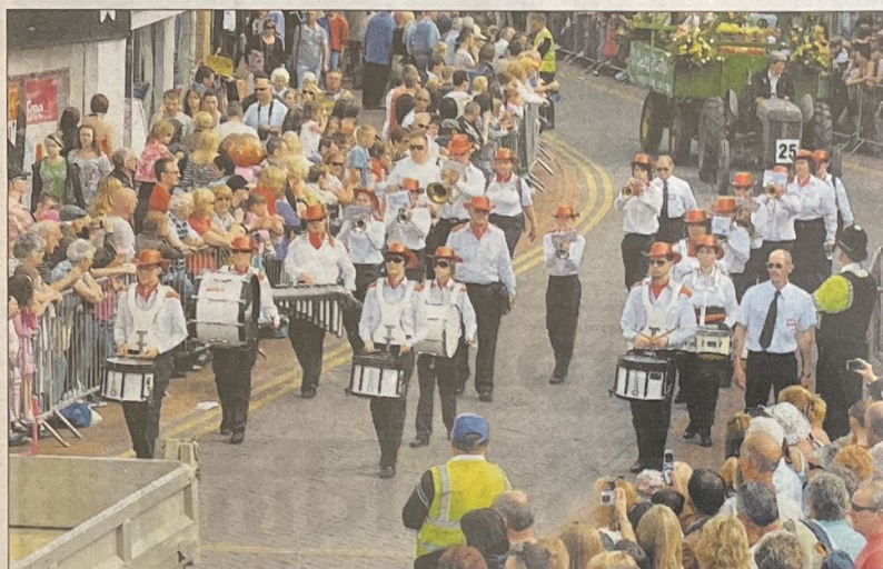
Spalding Ambassadors drum up support for the parade.