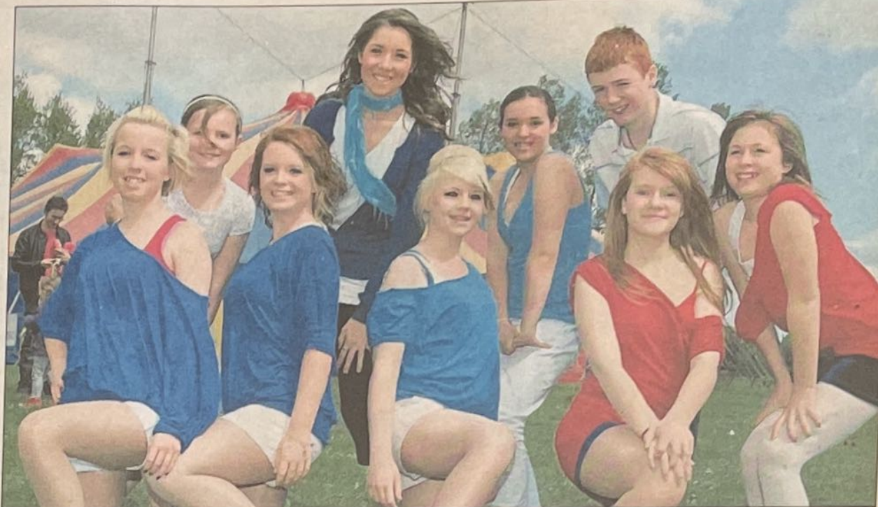
Polka Dot Academy performed excerpts from Britannia High at Springfields