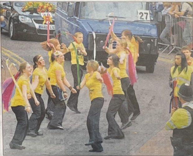
The Lighthouse Pentecostal Church dance troupe entertains with Christian Rock and pop-themed dancing.