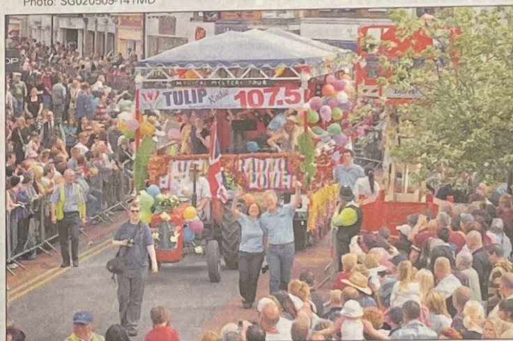
The Tulip Flower Power mobile stage housed Minus One playing songs from the 1960s.