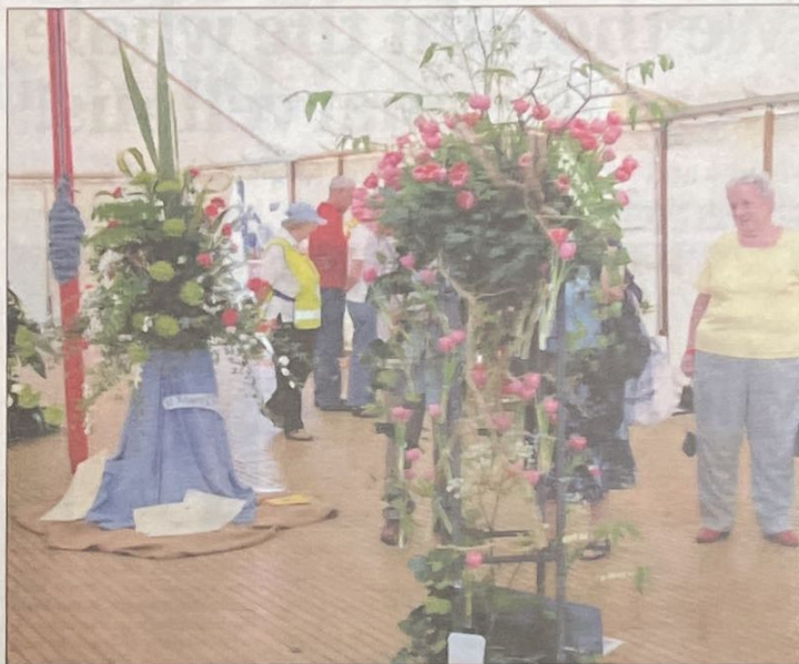
Floral displays at Springfields.

He added: "I think a good de-brief needs to be held. People need to decide that next year we need a cohesive plan for the entire festival. We are all in it for South Holland and we need to work together. We have done that this year but it hasn't been seamless."