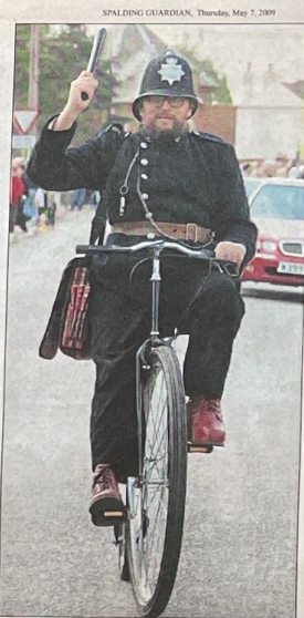
PC Persuasion keeps low and order at the Moulton Chapel Parade.