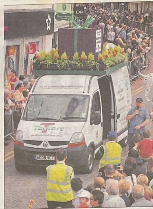
The Taylors Bulbs PA van rolls into Hall Place.