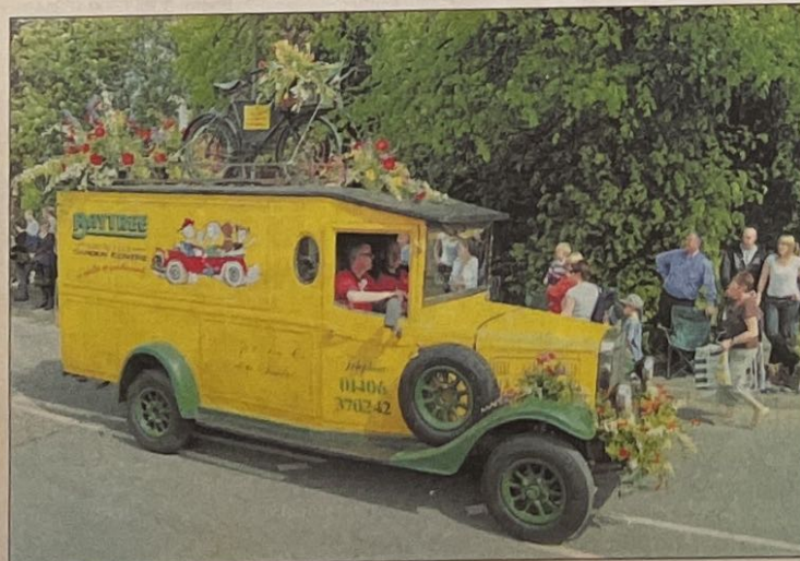
Baytree Nurseries Garden Centre vintage van marks 40 years in the gardening industry for the Weston firm.