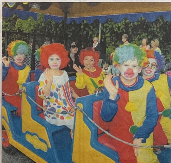
Friends of the Parade hop aboard the Smiley Train.