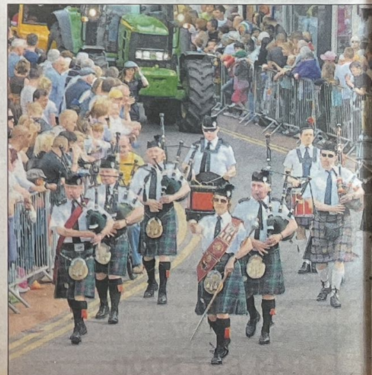
The Northampton Pipe Band makes its way through the parade.