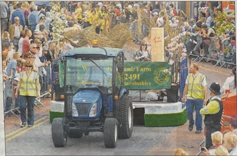
The Giles School of Old Leake entered the Japanese-themed float A Forest of Cranes.