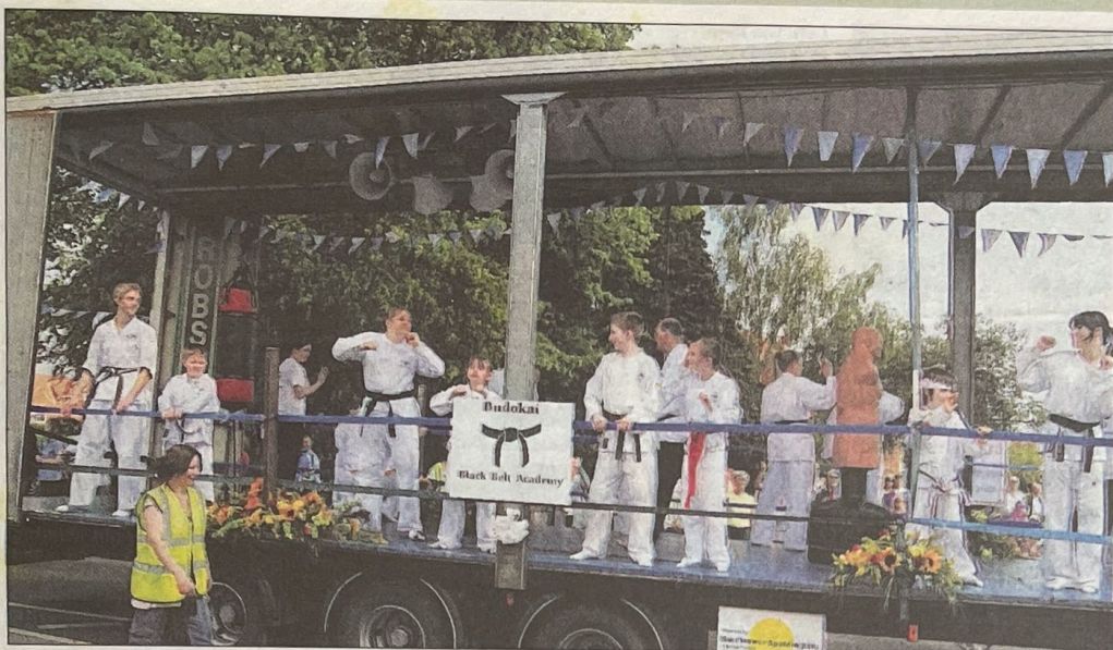
Above: Spalding Common-based martial arts school the Budokai Blackbelt Academy made its debut in the parade.