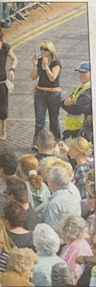
Parade.