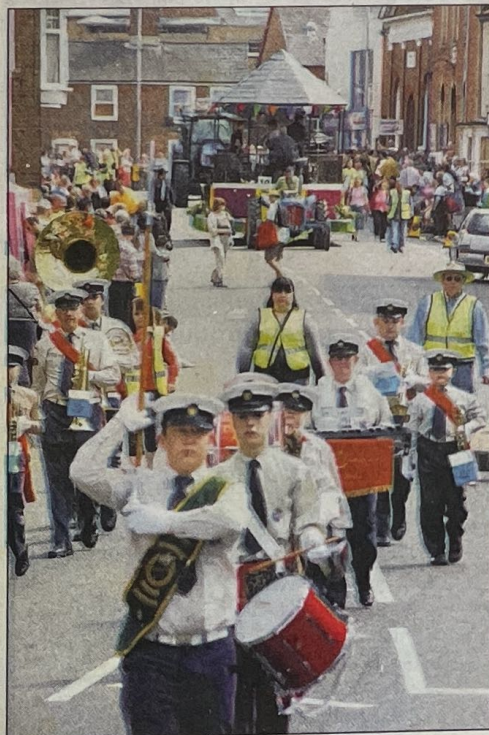
The 13th Coventry Scout Band – which first entered the parade in 1966 – marches through King's Road.