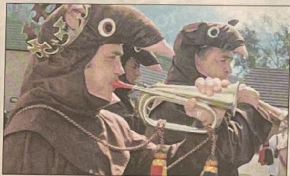
Musical entertainment from the unusually-dressed Romsey Old Cadets