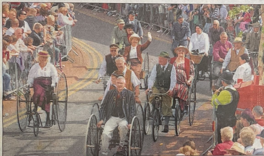
Left: Long Sutton and District Cycle Club made its 49th appearance in the parade in customary style.