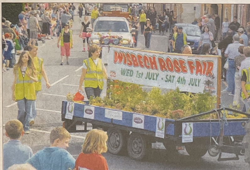
Wisbech Rose Fair's float blooms in the sunshine as it makes its debut in the flower parade.