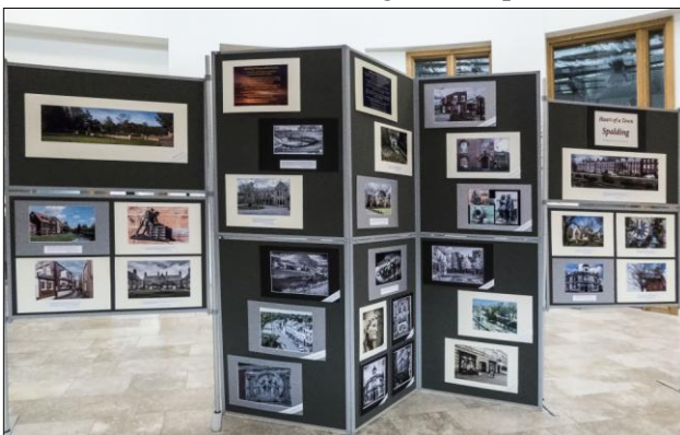
Exhibition at the Red Lion Quarter.