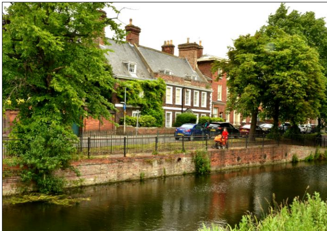
'The Limes', Double Street, one of the handsome historic houses along this stretch of the river.

Members are invited to send in photographs of parts or details of Spalding they particularly enjoy (print, memory stick or DVD) to the Editor – contact details below – with a few words about their choice.