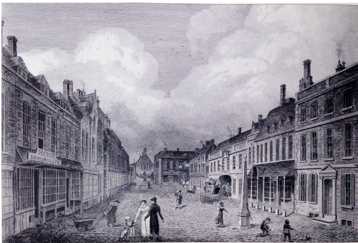
Spalding Market Place published 1822 by H. Burgess.