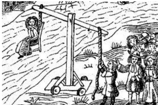
A Ducking Stool

The Prior also had the right to execute criminals and has its own Gallows. The Town Gallows were on Pinchbeck Road. Dishonest traders were paraded around the Town in this Tumbrel, and nagging wives and scolds were ‘ducked’ in the Trebucket or Ducking Stool, in the nearest pond.