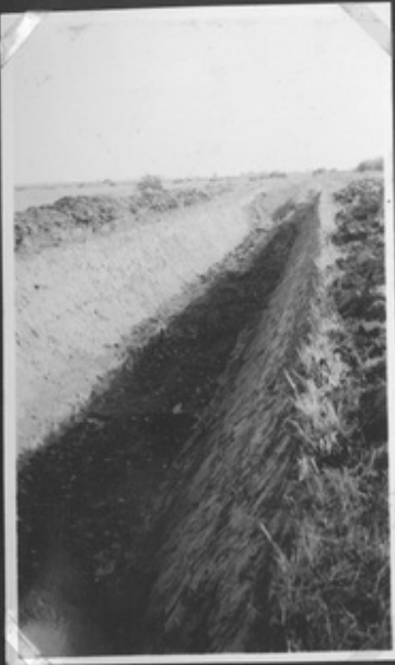
Sept. 40. Portion Completed by Hand Labour.