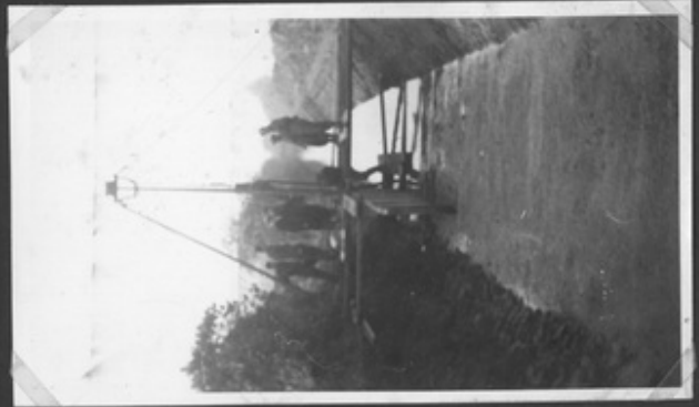
Piling in Cross Ditch Nov. 1st Dist.