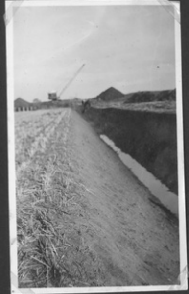
Completed by Dragline.